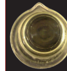
WINY - Enartis NTU* < 1